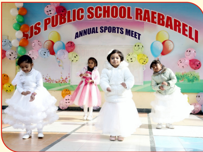
Annual Sports Meet