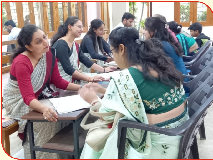
Parents Teacher Meet